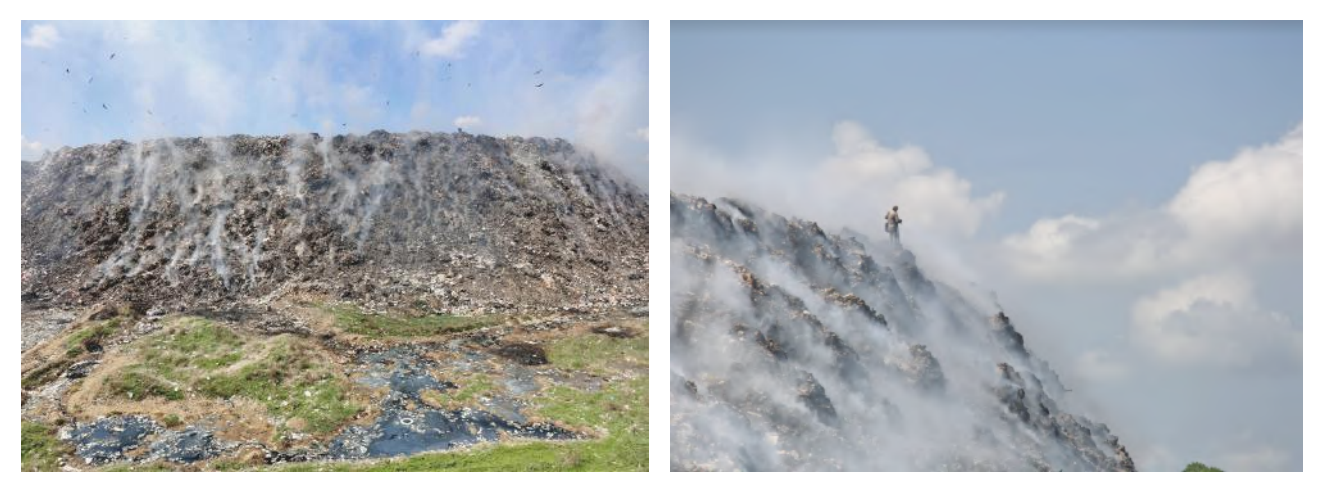
The waste dump of Bishkek burns day and night, emitting hazardous POPs: waste scavengers and villagers are exposed to the toxic smoke, water and soil pollution.

A survey from 2013 found that 44% of the waste recycling was done by homeless and 33% by pensioners, but did not give gender-disaggregated data [9].