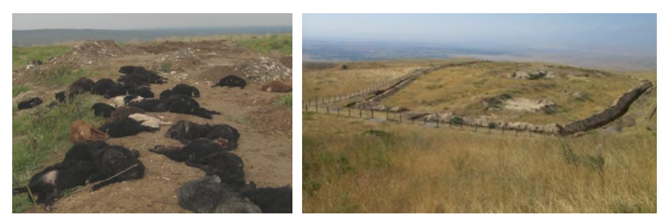
Animals that drank from puddles contaminated by the old pesticide burial site became ill or died. The burial sites are often only barely closed off.

The recommendation from the sociological survey is that a comprehensive gender analysis and human bio-monitoring measures should be done to understand the gender dimensions in such a project context. The gender analysis should include gender roles and responsibilities, access to resources (household income, productive resources: land, work) as a step to understanding different exposure and awareness levels.