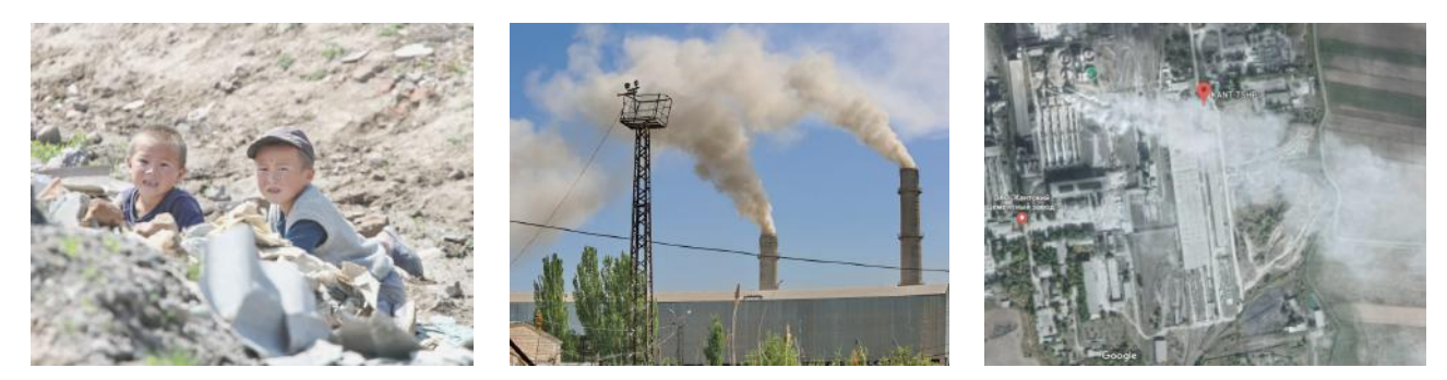
Children playing amongst asbestos waste and fumes from the asbestos cement factory spread over a nearby village and agricultural land

Scientists confirm that ashes and containing asbestos dust are spread from the factory's chimneys over the surrounding agricultural land and the village Dmitrievka. Scientists suspect possible health problems and pollution of local food crops. The representative of the Ministry of Labour told the project experts that safe and controlled management of chrysotile is being ensured, but when requested to comment on the safe management of asbestos waste, the ministry could not provide an example. The scientists and environmental NGOs confirm that there is a total lack of information on the potential hazards of chrysotile asbestos. During the scoping study, asbestos waste was found lying around at homes and in streets, including where children play. In Kyrgyzstan, there is a lack of reliable peer-reviewed data on the health impacts of chrysotile asbestos on women, men and children from secondary exposure, nor on occupational health of workers [5, 6].