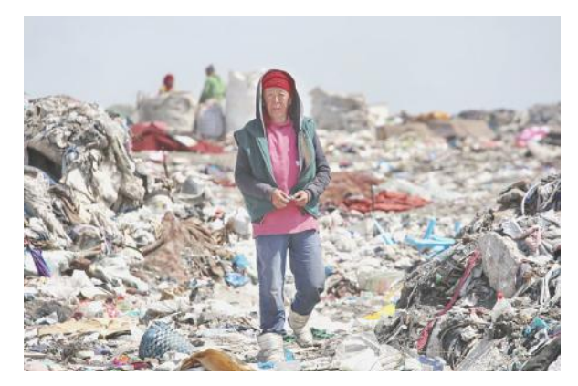
Plastic waste from cars, TVs and fridges often contain new POPs. Also old tyres and textile waste will emit POPs pollution when burned, but awareness is lacking.