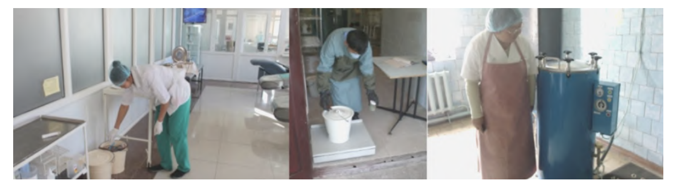
In Bishkek, medical centres now collect thermometers and other hazardous waste separately and disinfect the waste.

As a next step, still in the framework of the UNDP project 400 health workers (388 women and 12 men) in Bishkek medical centres were trained in cleaning, storing and transporting mercury-containing waste. As a result of the project the women handling hospital waste have received training and better equipment (well indicated, different sizes) which makes it almost impossible to mix up hazardous and normal waste or to have contamination [17].