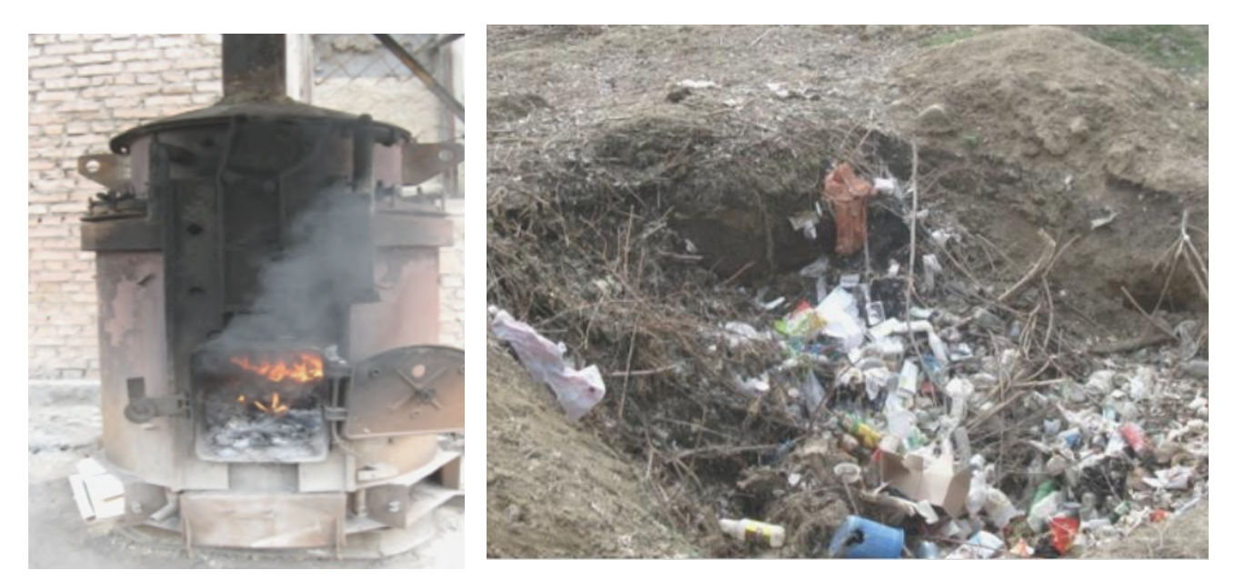
Previously medical waste would be mixed ,burned or dumped as in the example of this rural health centre (above), but now it is separated and safely treated.