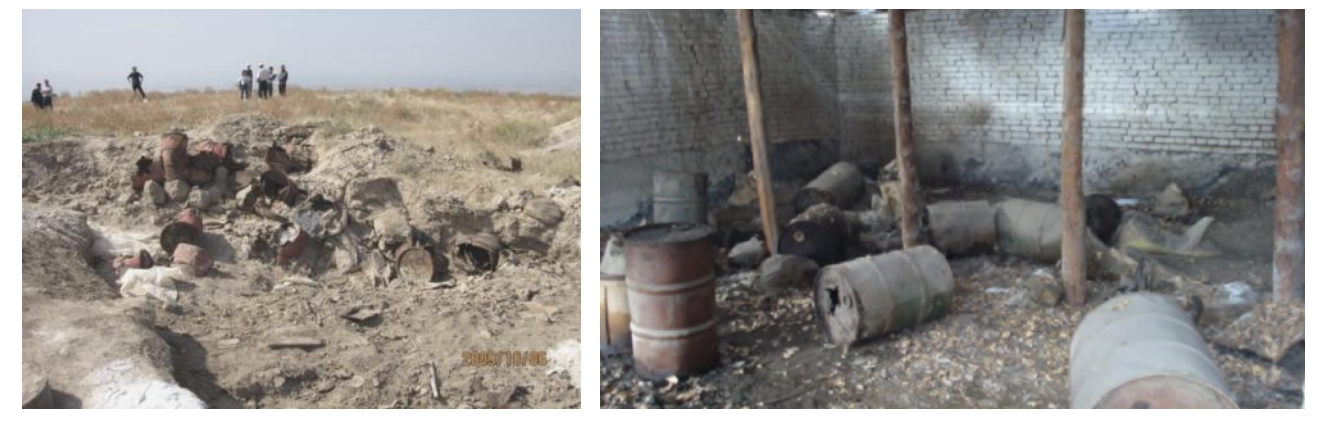
Burial sites and storage areas of higly hazardous banned POPs pesticides such as DDT have been emptied by people wanting to use or sell these pesticides.

A good practice is the work done by the environmental organisation 'Milieukontakt' from the Netherlands, jointly with Kyrgyz experts. They funded the project "Elimination of acute risk of Obsolete Pesticides in Kyrgyzstan" and identified 26 obsolete pesticides deposits in the Southern region of Osh. Out of these, 13 dumpsites were identified as priority sites to urgently clean up to contain further pollution. These dump sites have already polluted agricultural land and pastures. Through the Milieukontakt project measures were taken to protect and close off the 13 obsolete pesticide dumps, and 11 of the sites were completely cleaned up, repackaged and are now safely stored, waiting for a solution for the safe destruction of these POPs.