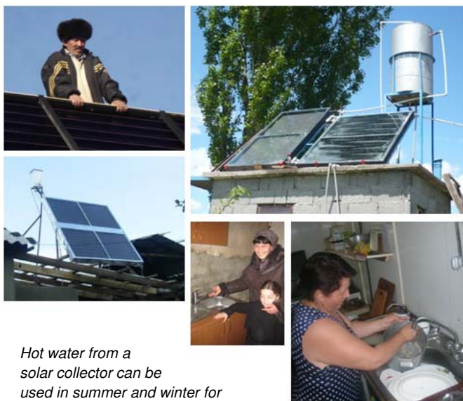
Hot water from a solar collector can be used in summer and winter for different purposes.

Imagine washing your dishes with hot water and taking a hot shower regularly at no cost other than installation! The solar collectors are designed to resist freezing, allowing year-round use even during cold winters. They are easy to construct and to maintain.