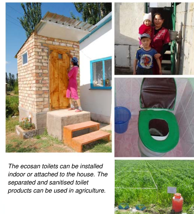
The ecosan toilets can be installed indoor or attached to the house. The separated and sanitised toilet products can be used in agriculture.

The toilet products – urine and faecal compost – can be used as organic fertiliser. Urine is an excellent liquid fertiliser containing nitrogen, phosphorus, potassium and many micro-nutrients. The fertilised plant will grow faster, develop more leaves and produce higher yields. Faecal compost is an excellent soil conditioner and fertiliser. The safe application of urine and faecal compost requires some basic hygienic agricultural considerations (acc. to WHO guidelines 2006).