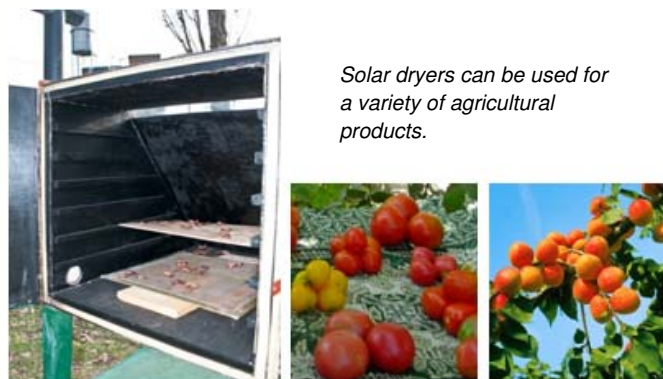
Solar dryers can be used for a variety of agricultural products.