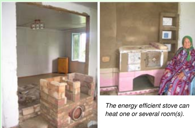
The energy efficient stove can heat one or several room(s).

An energy efficient stove burns fuel more efficiently and produces less smoke than conventional ovens. Through installing such a stove you will not only reduce your household fuel costs, but also improve your family's health. The energy efficient stove can heat your house with any kind of fuels such as coal, dry dung and wood.