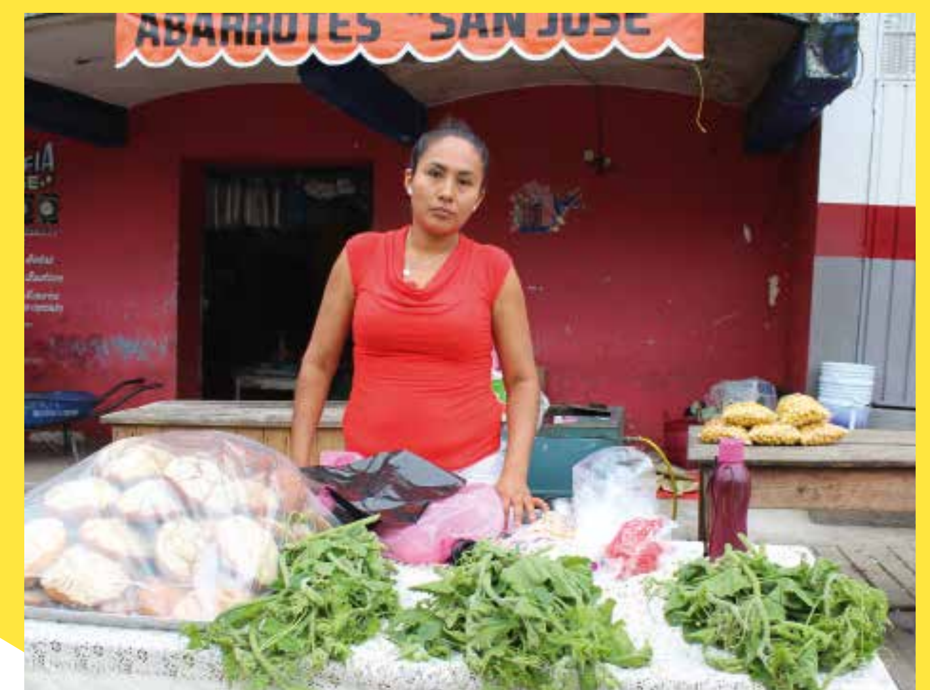
Woman on local market – Latin America