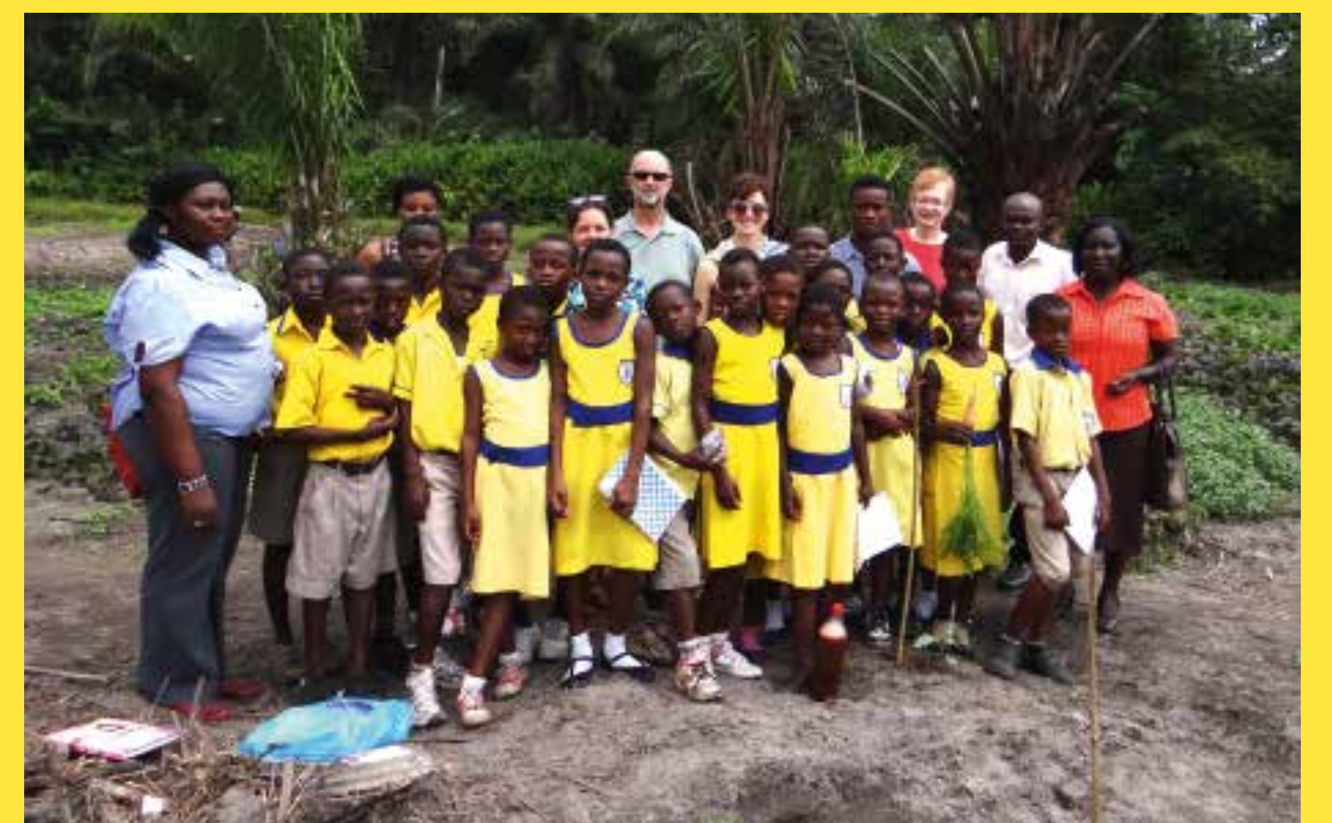
Girls' empowerment program - Africa