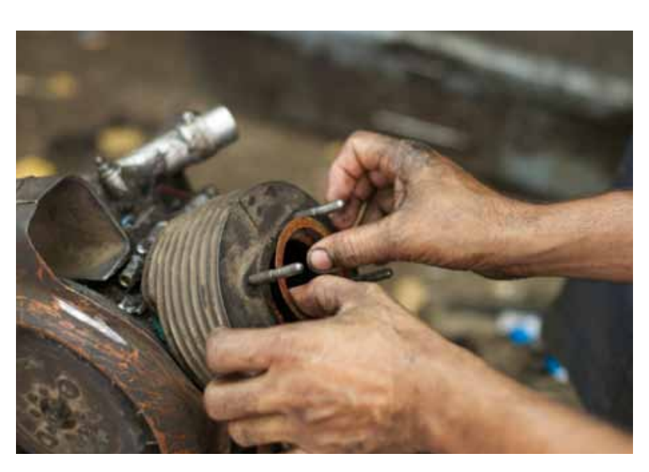
Replacing an asbestos gasket

Countries are allowed to grant permission for imports of chrysotile asbestos. There is no limit of volume or any other restriction regarding import and export.